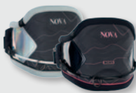
ITEM NO. 48213-4727 NOVA 6