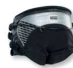
ITEM NO. 48212-4723 SONAR