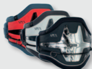
ITEM NO. 48212-4702 APEX 8