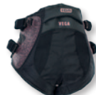
ITEM NO. 48213-4732 VEGA