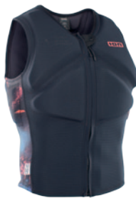
VECTOR VEST SELECT