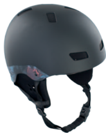
HARDCAP 3.2 SELECT

Every rider is different and wishes for different levels of protection. To make sure no one gets stuck in their comfort zone ION offers a wide range of protective gear suitable for radical water action.