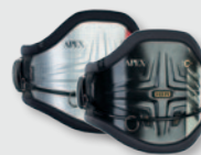
ITEM NO. 48212-4701 APEX CURV 13