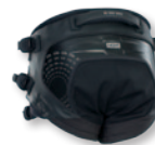
ITEM NO. 48212-4720 RADAR