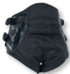
ITEM NO. 48212-4721 ECHO