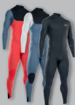
ITEM NO. 48212-4425 Seek Core Semidry 5/4 BZ DL