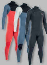
ITEM NO. 48212-4479 Seek Core Semidry 4/3 FZ DL