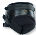
ITEM NO. 48212-4766 OCTANE