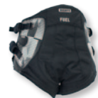
ITEM NO. 48212-4767 FUEL