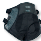
ITEM NO. 48213-4761 PEARL