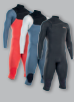
ITEM NO. 48212-4481 Seek Core Overknee LS 4/3 FZ DL