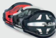
ITEM NO. 48212-4708 RIOT 9