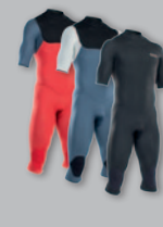
ITEM NO. 48212-4428 Seek Core Overknee SS 3/2 BZ DL