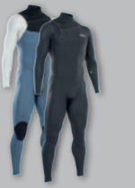
ITEM NO. 48212-4480 Seek Core Semidry 3/2 FZ DL