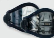
ITEM NO. 48212-4709 RIOT CURV 14