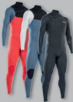
ITEM NO. 48212-4478 Seek Core Semidry 5/4 FZ DL

CORE LEVEL VERSATILE ALLROUNDER WITH PREMIUM FEATURES