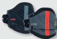
ITEM NO. 48212-4710 AXXIS KITE 4