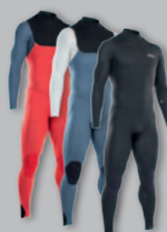
ITEM NO. 48212-4426 Seek Core Semidry 4/3 BZ DL